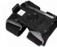
Wearable Arm Mount