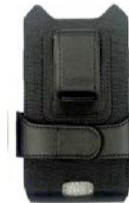
Wearable Arm Mount