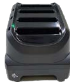
4 slot Battery Charger