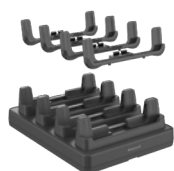
EDA10A-CB-0 EDA10A-CB-1 EDA10A-CB-2 EDA10A-CB-3 EDA10A-CB-5

EDA10A four (4) battery packs (EDA10A-BAT). Kit includes: charging base, power supply and power cord (-1 for U.S., -2 for Europe, -3 for UK, and -5 for AU).